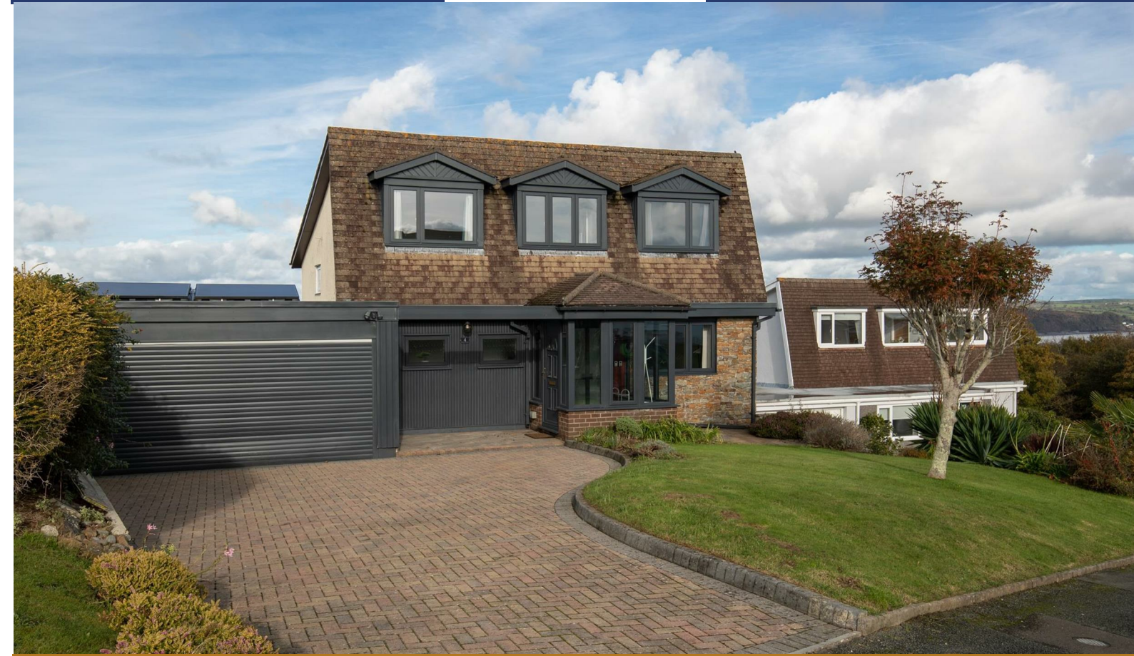
Golwg Y Mor, 4 Bevelin Hall, Saundersfoot, Pembrokeshire, SA69 9PG